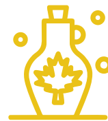
Liquid Dosages like Syrups