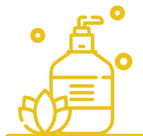
Creams, Ointments, Gels and Lotion