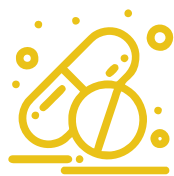
Solid Dosages like Tablets, Capsules, Granules and Powders etc

Our plant strictly adheres to the cGMP (Goods Manufacturing Practices) rules and regulations. We employ the most advanced facilities to manufacture Herbal and Nutraceutical Products in the form of the following: