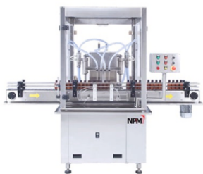
LIQUID FILLING MANUFACTURING