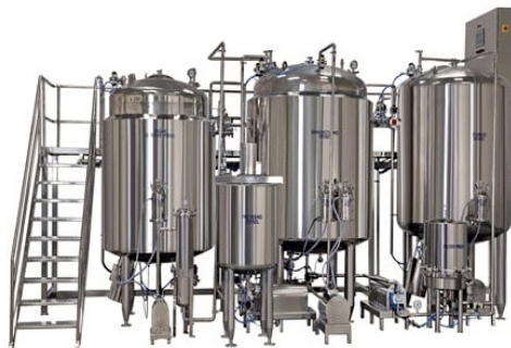
LIQUID SYRUP MANUFACTURING